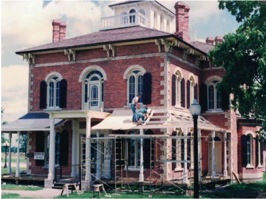
Flashback to 1992! Check out this photo taken during the original restoration of the Verandah in the Summer of 1992!