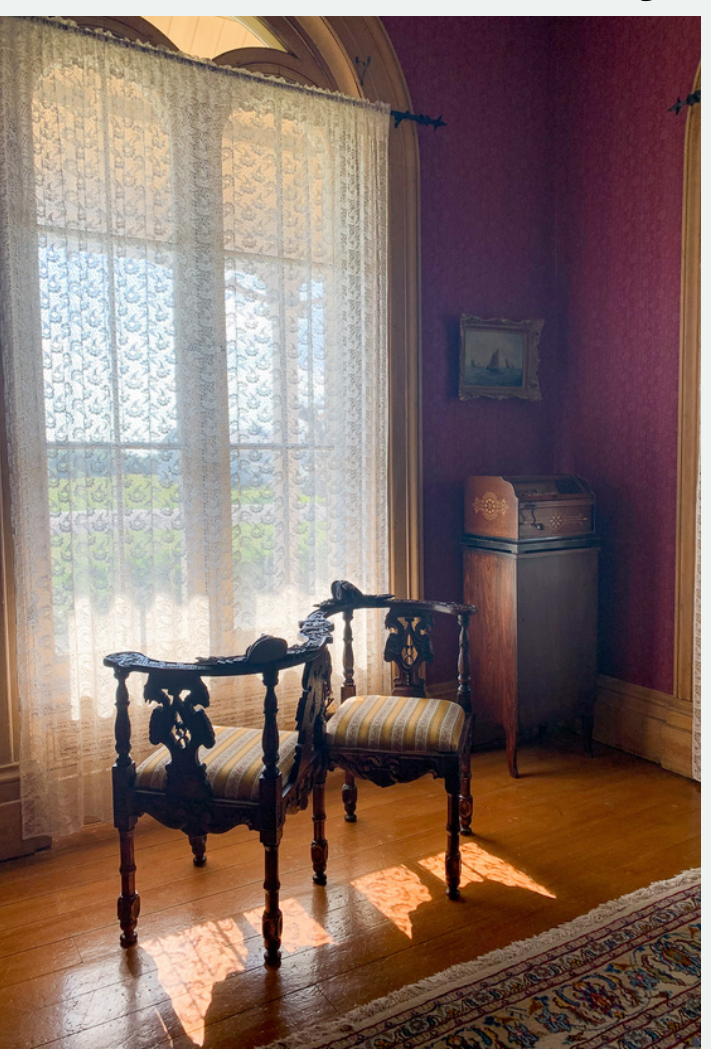
A new acquisition: A Victorian Conversation Chair