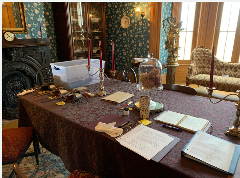
Accessioning some new Stereoscopes

It was exciting to dig into some curatorial work through our Inventory Project onsite this past January. There is something very special about the accessioning process, which requires detailing the object's provenance, age, and a description that includes every inch of the object. The final moment of installing the accession number on the object itself is thrilling, and signifies the reality that the object is now apart of the collections at Cottonwood. It will go on to be a teaching tool, and will amaze visitors for years to come.