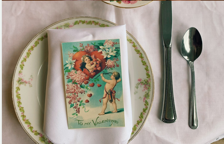
Each guest received a Victorian Valentine