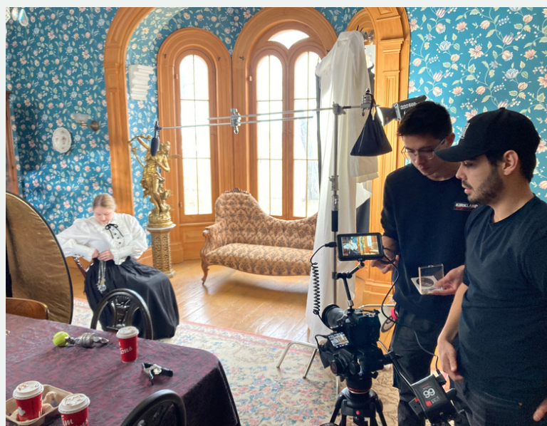
Filming day for the Victorian House Guest Experience marketing materials

Cottonwood's new experience, the Victorian House Guest Experience, had it's filming day on February 6th. Marketing materials were captured and the experience will go to market in April 2023. This program, covered by the From Great to Grand: Growing Tourism Experiences in Haldimand County grant, is an exciting new step forward for Cottonwood. Stay tuned and keep your eyes on our social media!