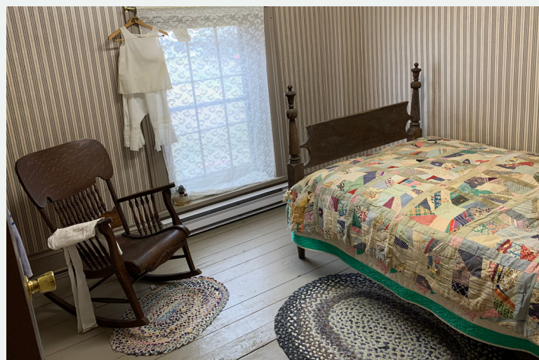
A servant's quarters bedroom is now set up and open for guests to view