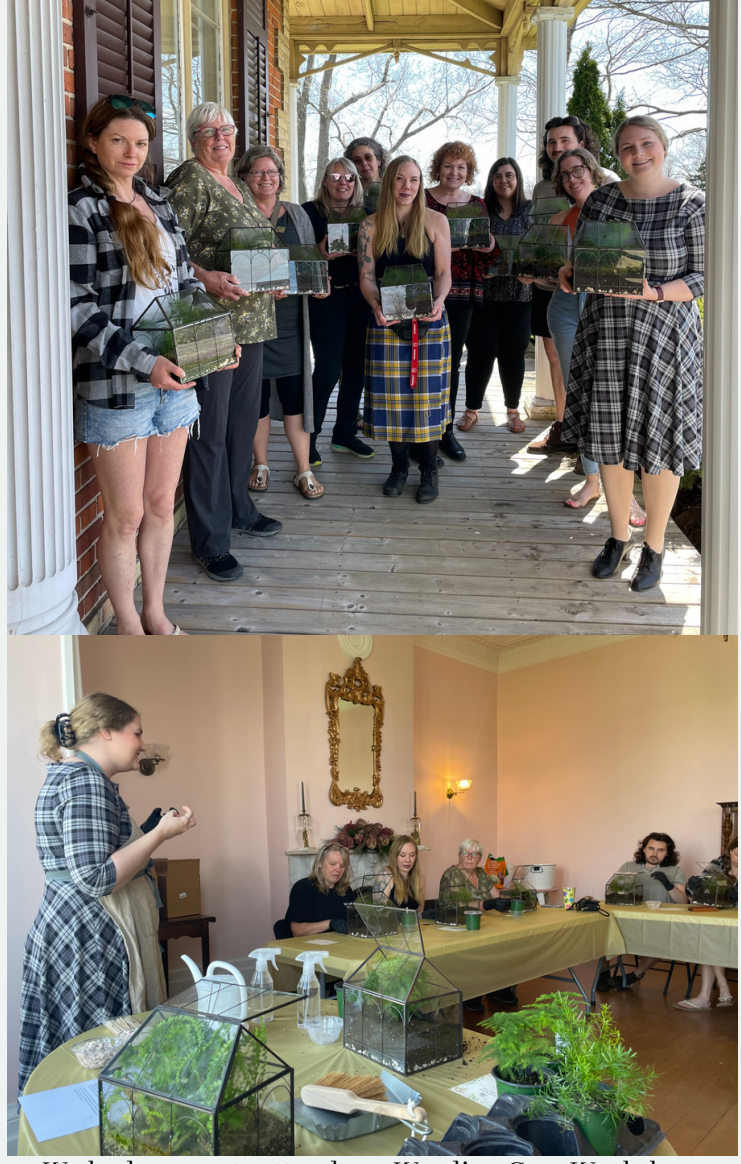
We had 10 guests attend our Wardian Case Workshop. Some of the materials were donated by local garden centre Eising Greenhouses. Thank you Eising!

Public Paranormal Investigation On April 15th, Cottonwood ran its first set of Public Paranormal Investigations. Similar to the Ghost Walks we ran in October, these investigations equipped guests with more equipment, access to more spaces, and the opportunity for independent investigations. We had a lot of activity onsite! Many guests were new to the mansion and hope to come back. Our next public Paranormal Investigation will be July 29th.