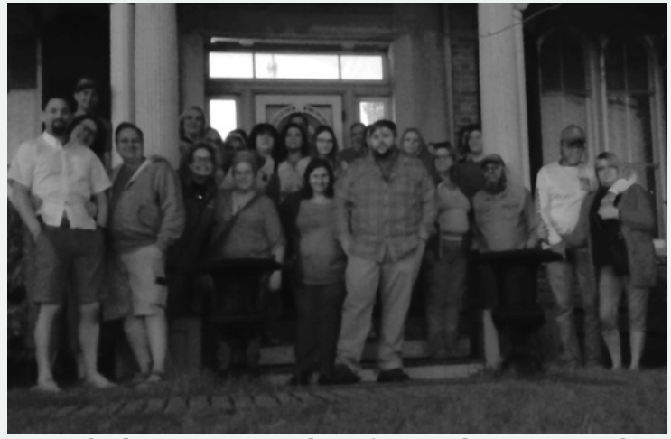
We had 35 guests attend our first Public Paranormal Investigation!