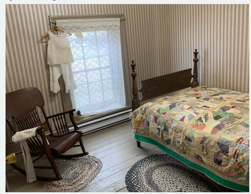
Servant's Quarter's Bedroom

Entering the recently opened servant's quarters bedroom at Cottonwood Mansion, we delve into the lives of Thomas Sheppard and Alice Day, a young couple who built a family within these walls.